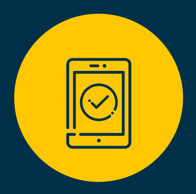
Create a Course