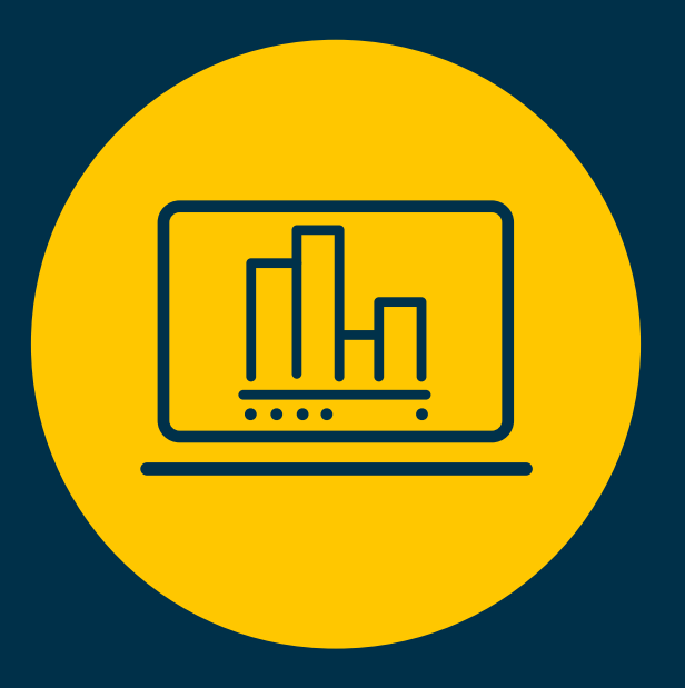
Train & Qualify Users