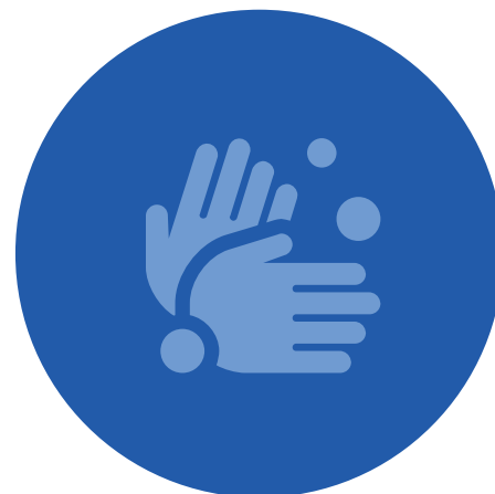
4. HAND WASHING