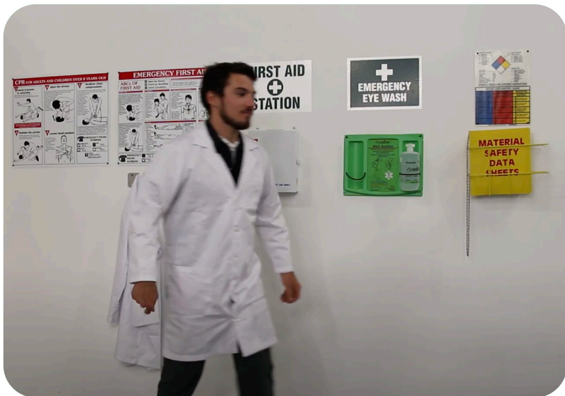
GOOD - Buttoned