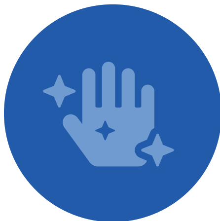
5. HAND DRYING