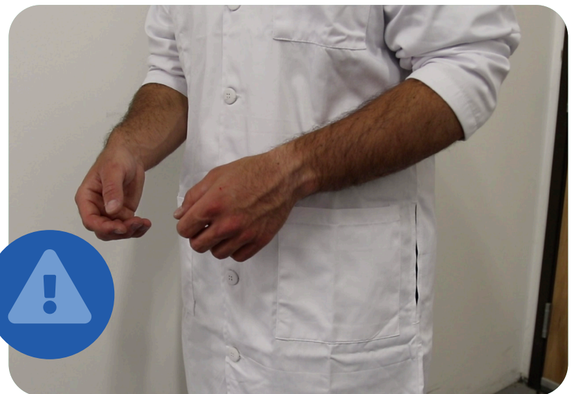
BAD - Sleeves Up