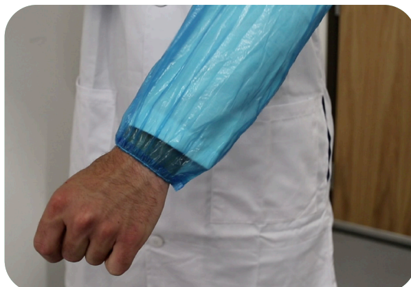
OPTIONAL - Sleeve Covers